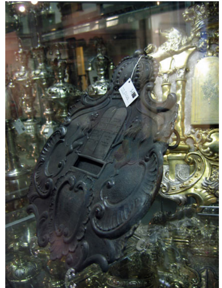
Jewish religious objects scorched by fire during the Kristallnacht at the Judisches Museum