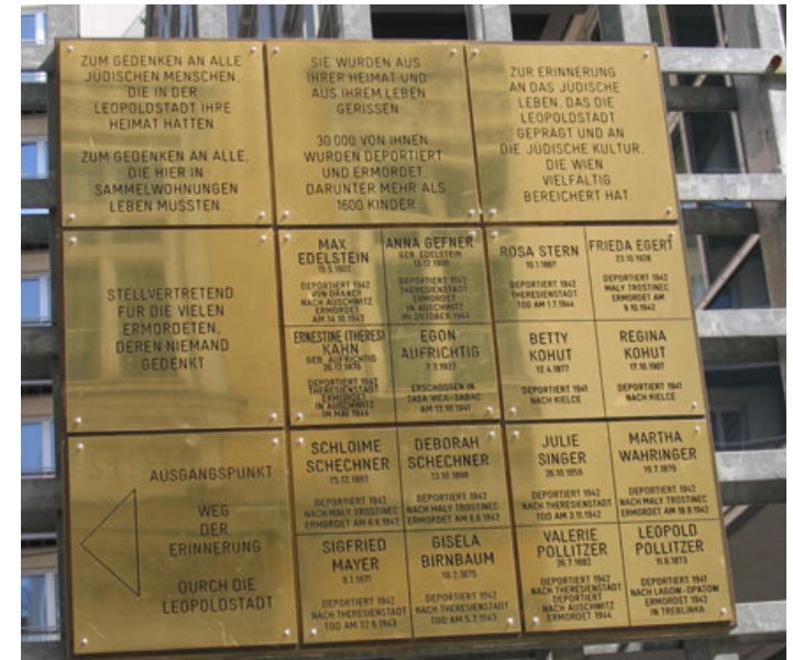
Stop #1 on the Path of Remembrance: The plaques on the place of the Leopoldstadt Temple destroyed in 1938 commemorate "all Jewish people for whom Leopoldstadt used to be home"