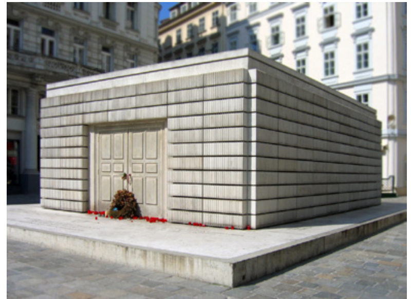
Vienna Holocaust Memorial on Judenplatz symbolizes a dead library: the doors are locked and the books face inwards.

The flourishing Jewish community of Austria 2 was all but obliterated during World War II. At first, Austrian Jews were lucky: unlike Germany, Austria had exit avenues open for a while and almost two thirds of the country's Jews left. Those who stayed died wretched deaths at places like Theresienstadt and Auschwitz. One Vienna resident, Sigmund Freud went to London with his family; his two elderly sisters stayed and perished.